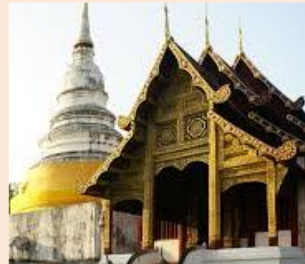
Wat Phra Singh – Monastery of the Lion

Siddhartha Gautama (@ 563 – 483 B.C.) left his princely position at the age of about thirty, basically to seek enlightenment and to teach the futility of materialism. He is respected as the Buddha, the enlightened one.