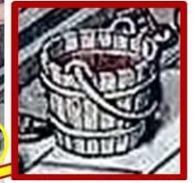
Vessel with vinegar