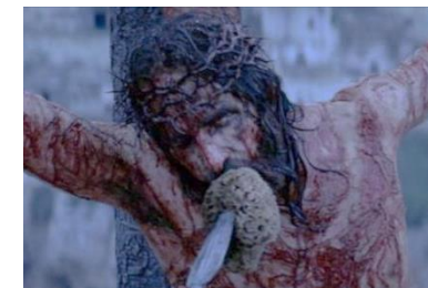
Loved you once, love you still. Always loved you, always will.

And they filled a sponge with vinegar .. and put it to his mouth . When