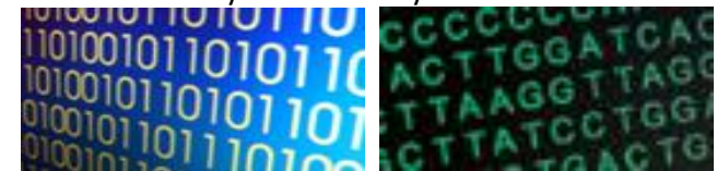
Intricate computer programming