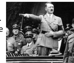
We forget so soon

Right now we have abundant SABRE-RATTLING and military muscle flexing by the super powers. Soon world peace will seem an unattainable illusion. This together with the collapse of the world economy gets us ready for anyone to save us. Once the financial markets Collapse, history will repeat itself. The time will be ripe to launch the 'New World Order' and we will again get a strong leader to pull us out of the slump.