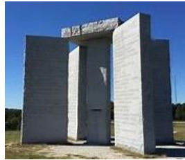
Georgia Guide Stones built in 1980

It is carved in the 'Georgia Guide Stones' and advocated by numerous public figures to: "Maintain humanity under 500,000,000 (half a billion) in perpetual balance with nature."