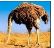
Don't prepare like this guy!

As the universe turns on a precision timetable, so we have arrived at the threshold of time in world history where hundreds of prophetic scriptures are about to be fulfilled.