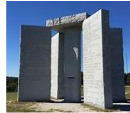
Georgia Guide Stones built in 1980

It is carved in the 'Georgia Guide Stones' and advocated by numerous public figures to: "Maintain humanity under 500,000,000 (half a billion) in perpetual balance with nature."