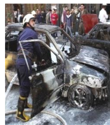
No Rat-Race Stress - No more Violence - No more Terrorism