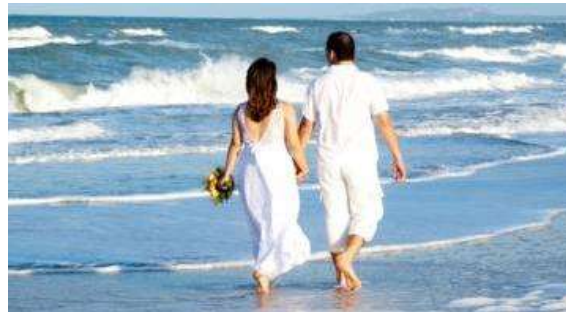
Washing it all away in the Ocean of his Love.

Someone comes to greet me; I look up and can hardly believe it. It is him, the love of my life, my eternal Soul-mate, my Jesus .