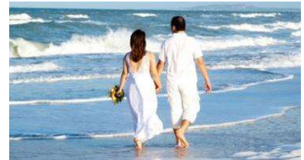
Washing it all away in the Ocean of his Love.

Someone comes to greet me; I look up and can hardly believe it. It is him, the love of my life, my eternal Soul-mate, my Jesus .