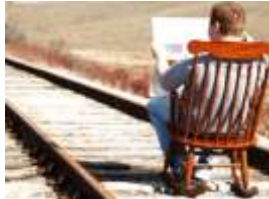
The express train of God's will is running right on time!

Now it's time to not sleep but to gather oil to memorize and study these Vital Scriptures . "The wise took oil... the wise shall understand."