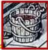
Vessel full of vinegar