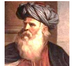
Abraham @ 2191-2016 B.C.

Although he tried to get people’s attention, no one listened. Finally, God found Abram who chose to listen. He told Abram, ‘Look, I will make of you a great nation. You will be called Abraham.’ He showed him a good land that he promised to his descendants.