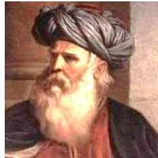
Abraham @ 2191-2016 B.C.

Although he tried to get people's attention, no one listened. Finally, God found Abram who chose to listen. He told Abram, 'Look, I will make of you a great nation. You will be called Abraham.' He showed him a good land that he promised to his descendants.