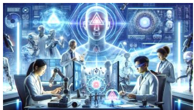
The race to develop AGI is on

At present we have A.I. “helping us” and now the scientists are developing AGI (Artificial General Intelligence) meaning that this technology can draw its own conclusions and make its own decisions