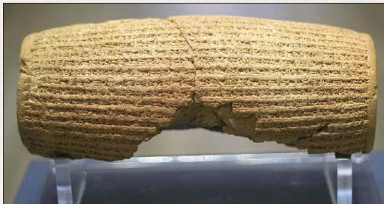
2012 Wikimedia Commons

Left: Front and back of the inscribed 9" x 4" barrel-shaped cuneiform proclamation known as the Cyrus Cylinder. It is apparently the earliest example of the Persian rewrite of history that sought to minimize or even eliminate the roles of Belshazzar, king of Babylon, and Cyaxares II / Darius the Mede, king of the Medes, in the conquest that ended the Neo-Babylonian Empire. It was commissioned by Cyrus sometime between 537 BC and his death in 530 BC.