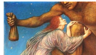
Part of Painting: Evelyn De Morgan

No, No, No, we prefer a popular message that soothes our nerves. We say, 'Speak to us smooth things, prophesy deceits:' (Isa 30:10) 'With their mouth they show much love, but their heart follows greed. You are for them a very lovely song: for they hear your words, but don't do them.' (Eze.33:31,32)